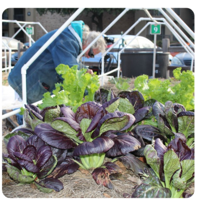
Cole crops like pak choy and mustard greens thrive despite cool temperatures