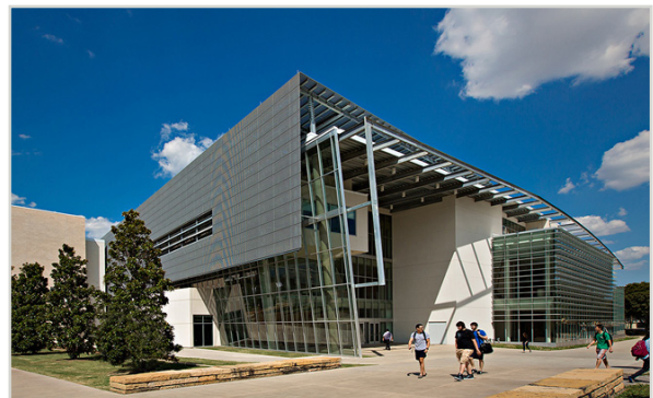
Edith O'Donnell Arts and Technology Building, University of Texas at Dallas