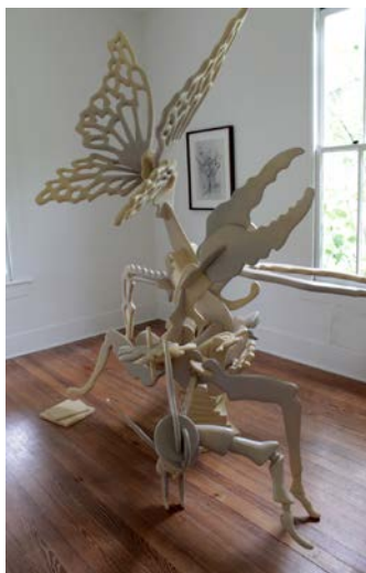
Vesna Jovanovic, Moth ; 2013; 80" x 60"; ink and graphite on polypropylene (left)