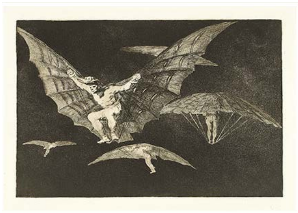
Francisco de Goya y Lucientes (1746 – 1828). Los Disparates. A Way of Flying . Plate No. 13. 1815-1824, etching and burnished aquatint, Meadows Museum, SMU. Algur H. Meadows Collection. MM.67.06.13

At The Meadows Museum, September 21 – March 1, 2015