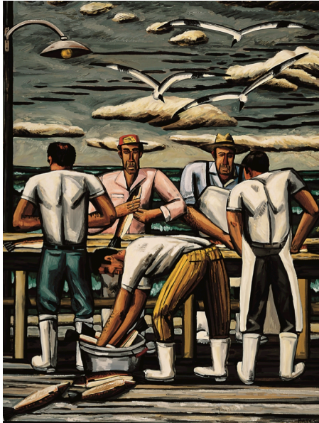
The Cleaning Table , 1990 Oil on canvas 84 x 64 inches Barrett Collection, Dallas, TX © David Bates